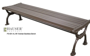
Benches with No Back