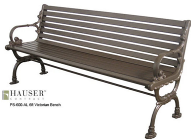
Benches with Back